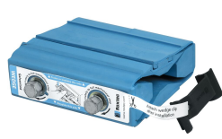
Wedge & Wedgekit